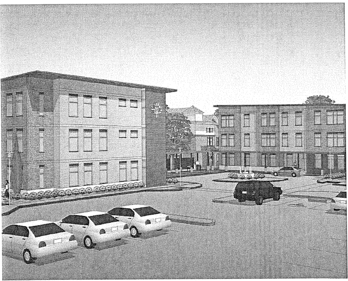
Exhibit 1: Project Images