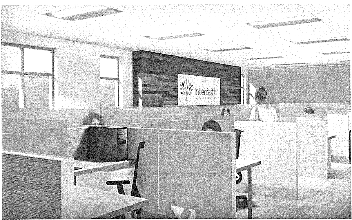
Career Services Rendering