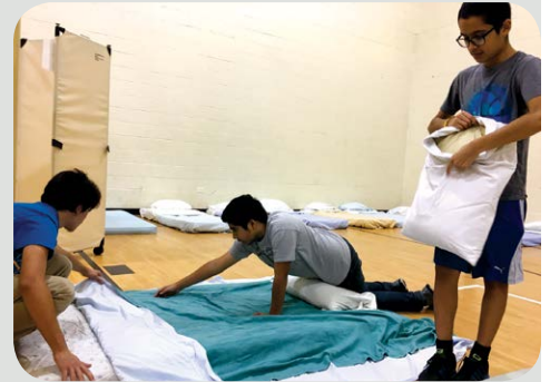
CRSM student volunteers at PADS

his mom, who is raising him and his three younger siblings by herself.