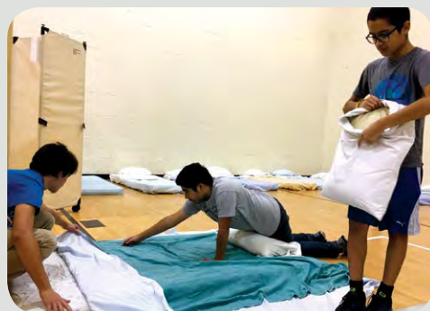
CRSM student volunteers at PADS

his mom, who is raising him and his three younger siblings by herself.