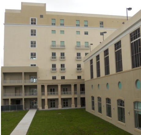
Top: Aerial view of The Norwegian Cruise Line Campus of Camillus House in Miami, FL

Hiring priority for construction workers is given to low-income residents living within a 5-mile radius of the project. There will also be an apprenticeship program to train and hire low-income residents and persons who are homeless. Located in a highly distressed, low-income neighborhood on a vacant city center site that has been empty for many years, the project is also a major social and economic improvement to the neighborhood. Named for one of its largest charitable corporation contributors, "The Norwegian Cruise Line Campus" of Camillus House is an integral part of the city and county revitalization plans for the area.