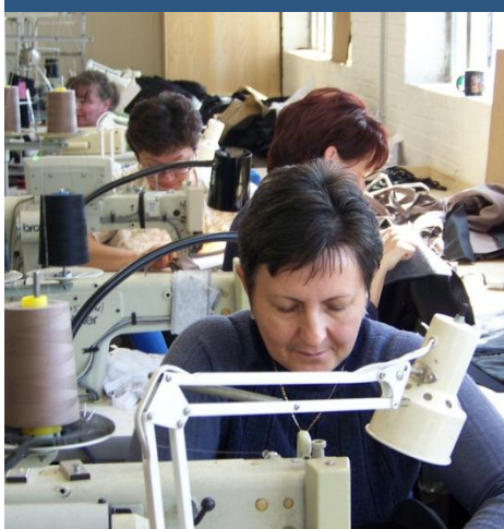
Top: Garment workers measure and cut fabric at A.I. Industries, Inc. in Chicago, IL

Today, Bethel is helping A.I. Industries secure a SBA loan for additional equipment. This will enable the company to hire 100 additional employees. As a result of New Market Tax Credit financing, A.I. Industries is optimistic about its goal to increase sales by more than $7 million in five years.