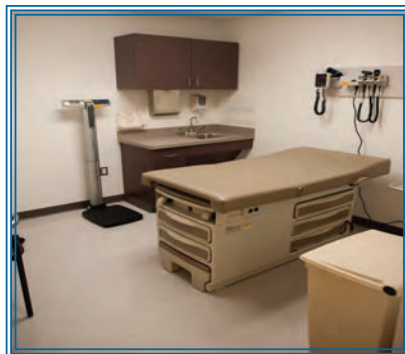
Interior views of an exam room and reception area at Codman Square Health and Education Center

The expansion will provide Codman Academy with 10 additional classrooms, including 2 science labs and a science/art room, a library, faculty work and storage space, student/alumni meeting space, and an outdoor teaching area. The health center and school will share a black box theatre (Dorchester's first), which will be used by the community for plays, musical performances and lectures. The community will also have access to a dining facility and teaching kitchen, used for a wide variety of adult education classes.