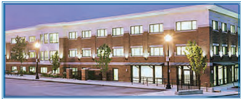
An exterior view of Codman Square Health and Education Center

The expansion will provide Codman Academy with 10 additional classrooms, including 2 science labs and a science/art room, a library, faculty work and storage space, student/alumni meeting space, and an outdoor teaching area. The health center and school will share a black box theatre (Dorchester's first), which will be used by the community for plays, musical performances and lectures. The community will also have access to a dining facility and teaching kitchen, used for a wide variety of adult education classes.