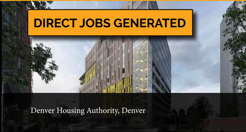
Denver Housing Authority, Denver