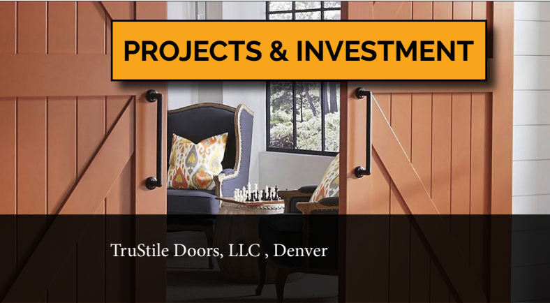
TruStile Doors, LLC , Denver