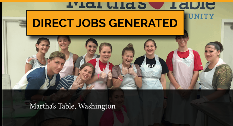
Martha's Table, Washington