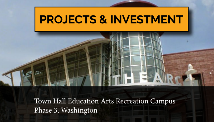
Town Hall Education Arts Recreation Campus Phase 3, Washington