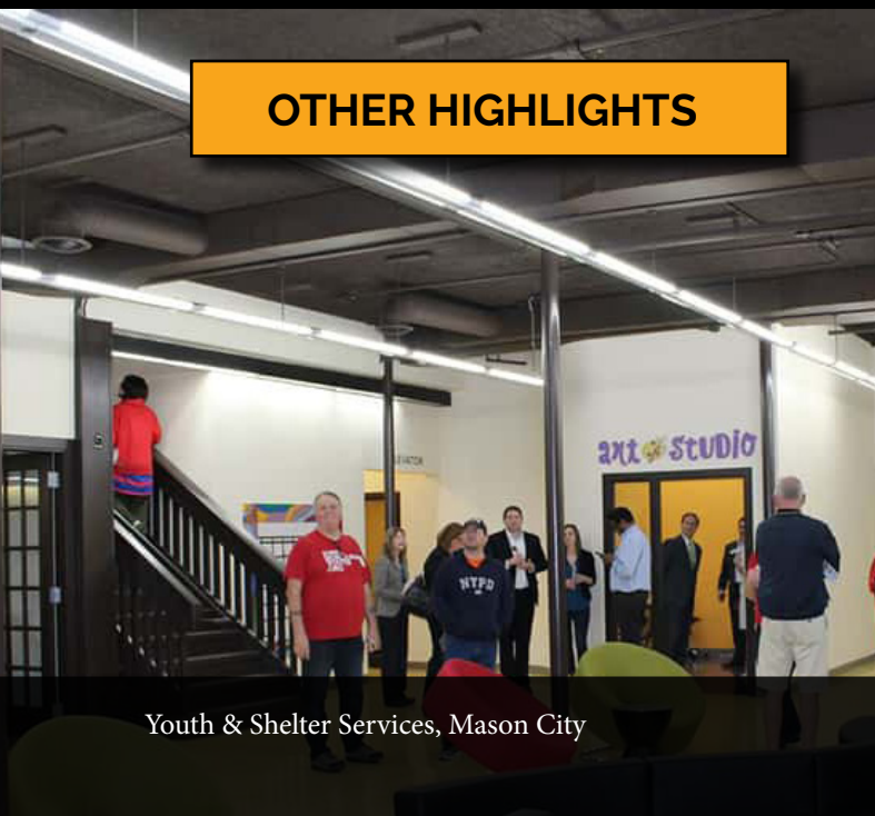
Youth & Shelter Services, Mason City