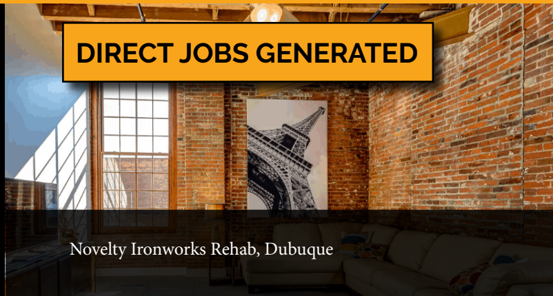
Novelty Ironworks Rehab, Dubuque