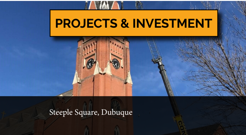
Steeple Square, Dubuque