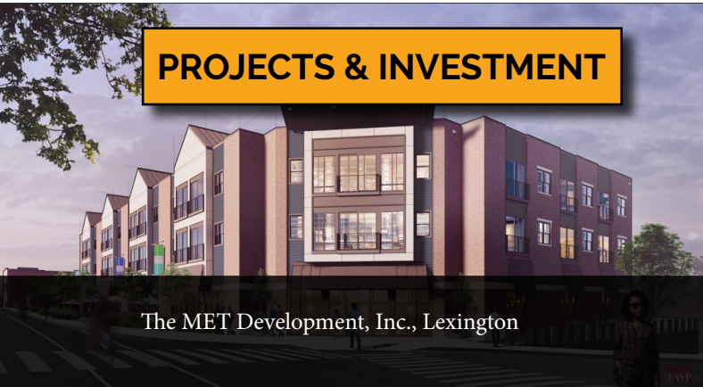
The MET Development, Inc., Lexington