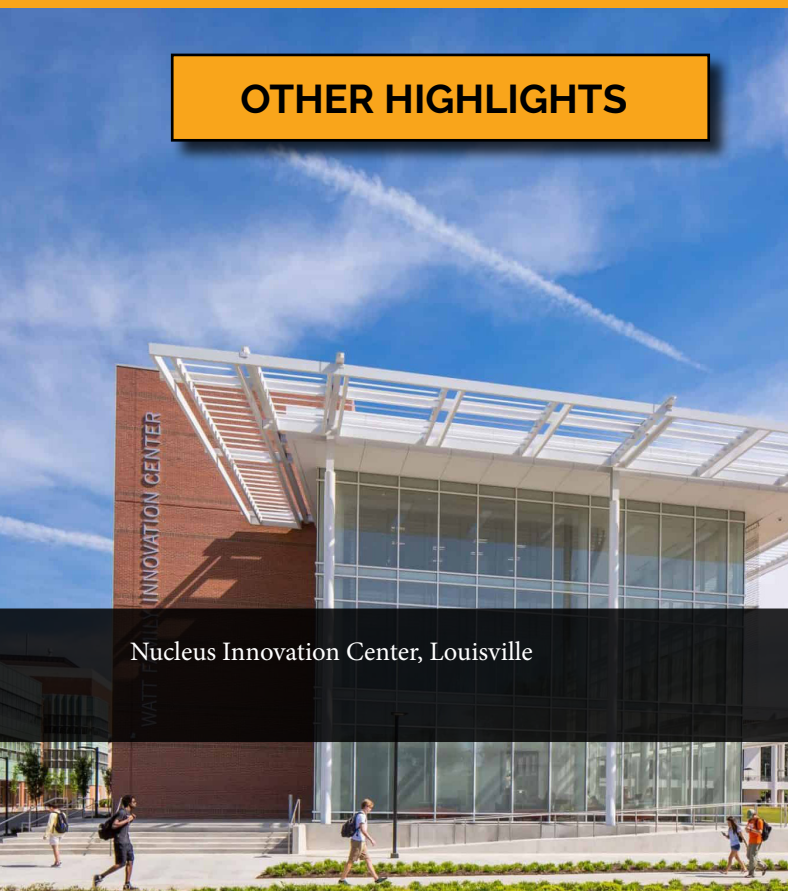
Nucleus Innovation Center, Louisville