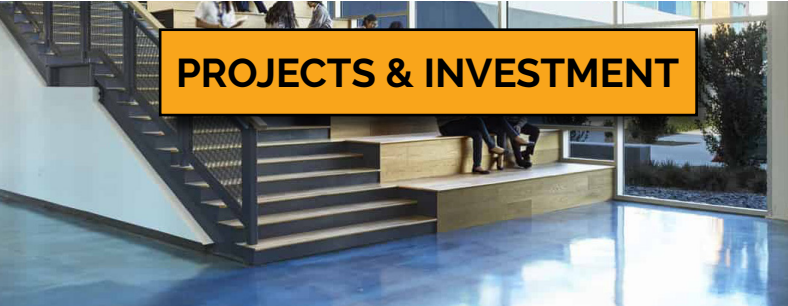
Cristo Rey St. Viator College Preparatory, North Las Vegas