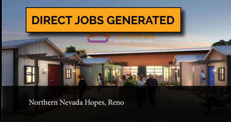
Northern Nevada Hopes, Reno