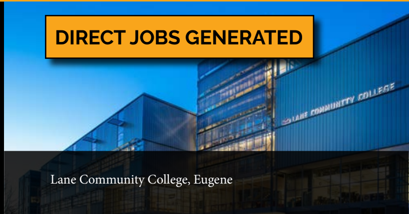
Lane Community College, Eugene