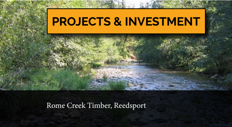
Rome Creek Timber, Reedsport