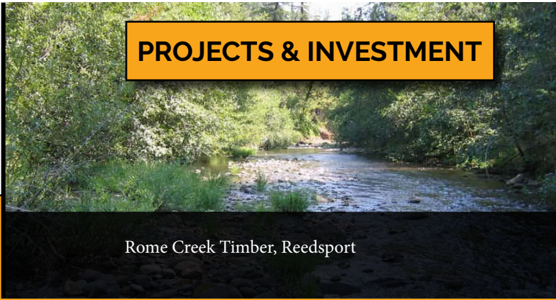
Rome Creek Timber, Reedsport