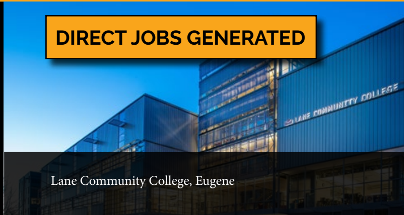
Lane Community College, Eugene