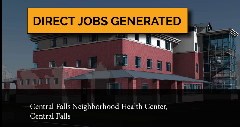
Central Falls Neighborhood Health Center, Central Falls