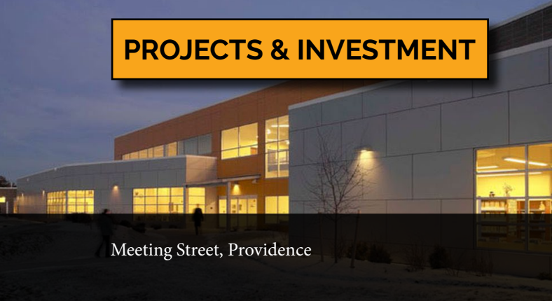
Meeting Street, Providence