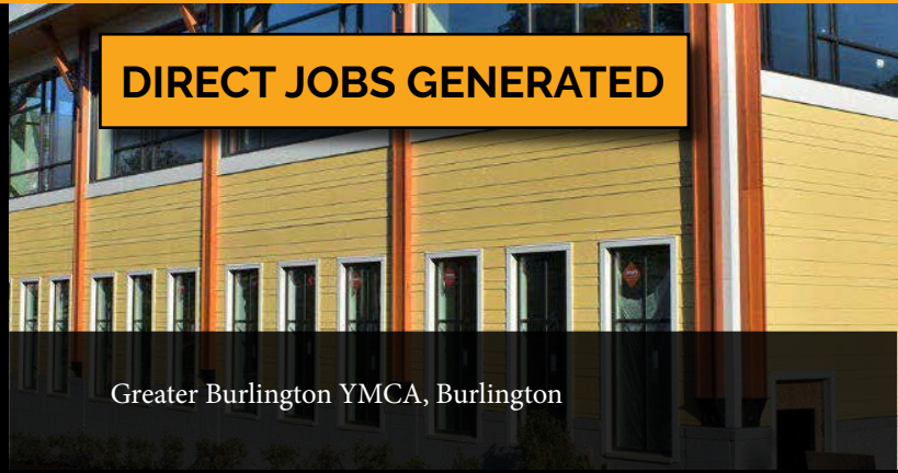
Greater Burlington YMCA, Burlington