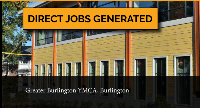
Greater Burlington YMCA, Burlington