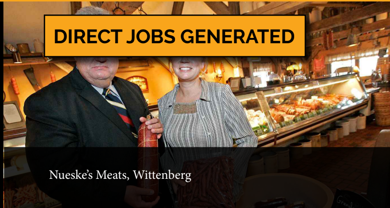
Nueske's Meats, Wittenberg