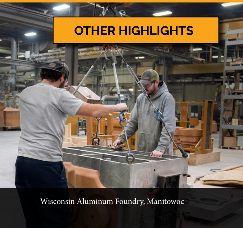
Wisconsin Aluminum Foundry, Manitowoc